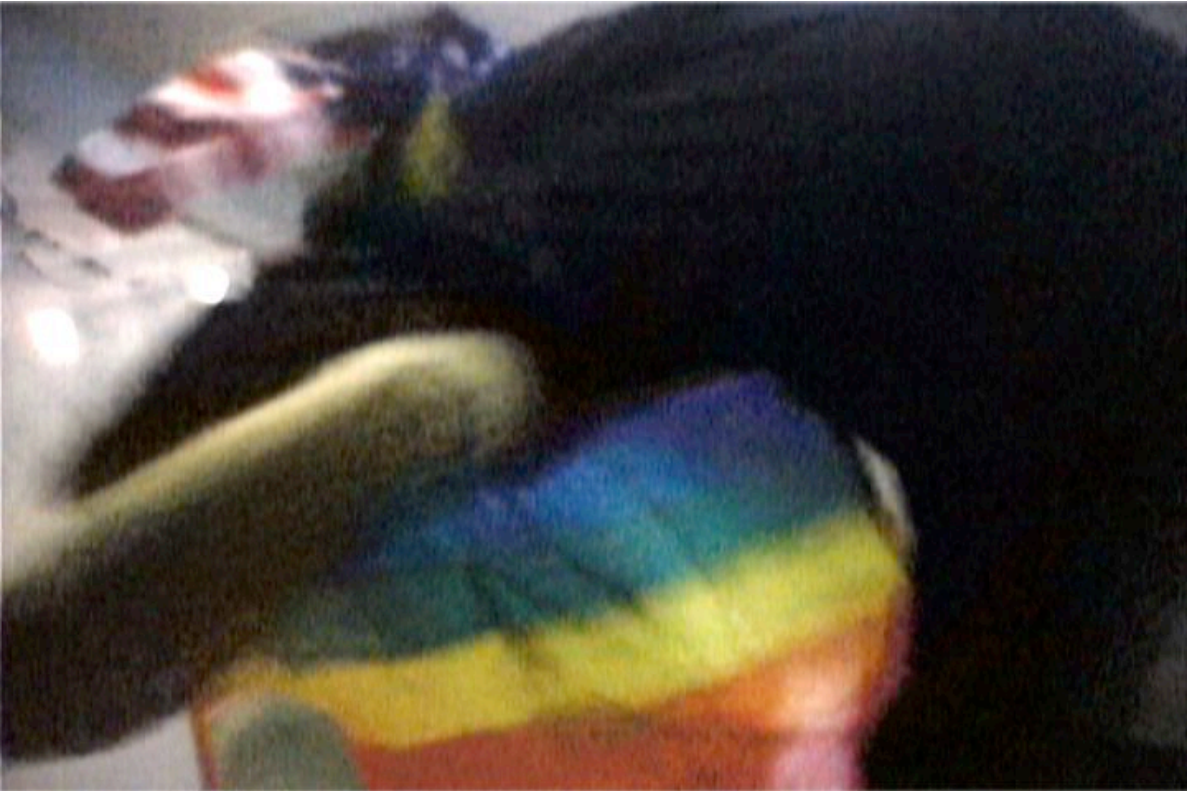
Frank Pietronigro, Flags In Space! May 4, 2006